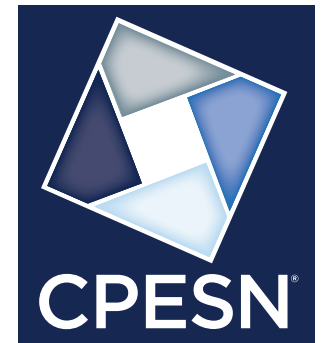
ALTERNATE LOGO ON PMS 655