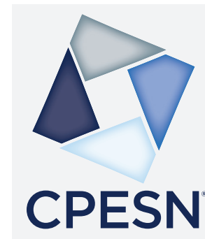
LOGO ON 5% BLACK